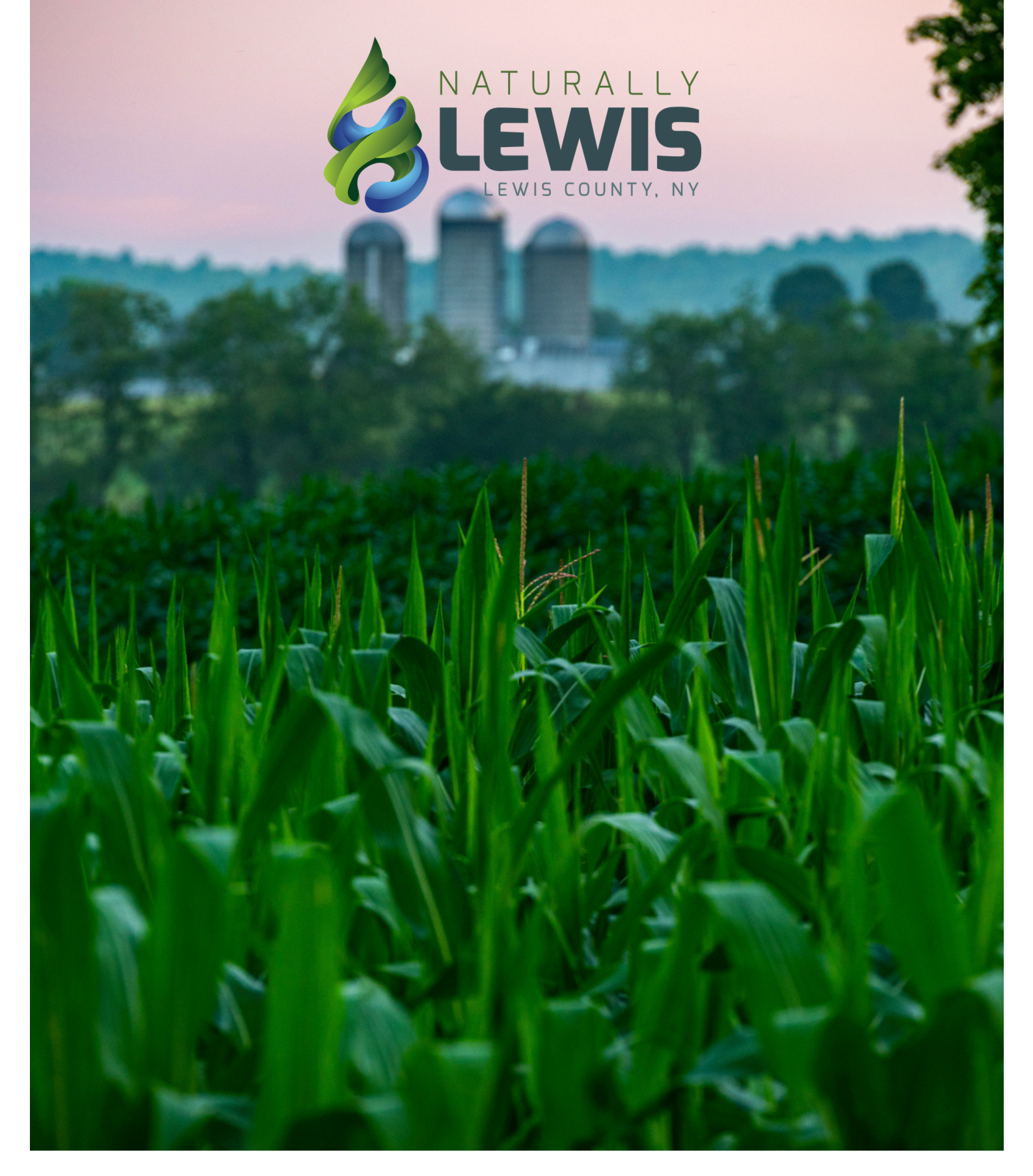
2022 ANNUAL REPORT Frowing, a more sustainable Lewis County